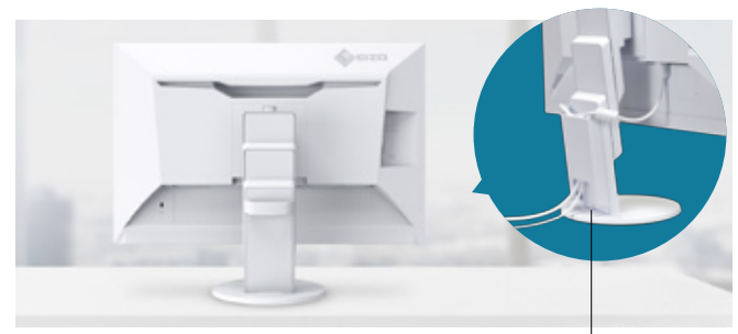
Included cable cover neatly hides cables

With the monitor's white cabinet option, your office environment becomes brighter and more lively. In addition, the entire office can be stylishly coordinated white matching white cables.